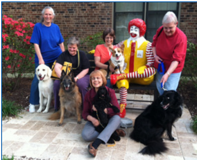
Graduates from the Spring 2013 Pet Therapy class.

In the case of my long-ago patient, Stone, with whom I first walked this path, I am glad to say that he did not suffer unnecessarily with osteosarcoma. His owner made a good decision, and Stone crossed the rainbow bridge while in the loving arms of his people. He was remembered by them as a strong, loving protector of the children in his family, and I will always remember his owner for having the strength and wisdom I hope we’ll all have when the time comes to say that final goodbye.